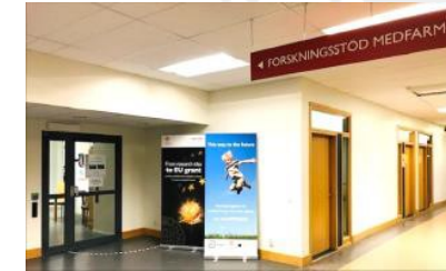
Medfarm: BMC A2:1