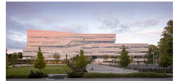
Teknat: Segerstedt floor 4