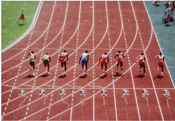
The application process

The cooperation starts already at the application stage – ensure you have a good report with the other partners.